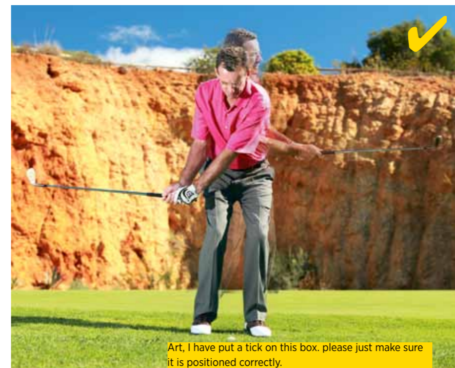
Art, I have put a tick on this box. please just make sure it is positioned correctly.

It's a classic fault that we all know to avoid but that under pressure, all too often creeps in. The club must accelerate through impact – any loss of speed here and a duff chip is the most likely outcome. So, as you address the ball concentrate on ensuring that your follow through is longer than your backswing. It's a very simple thought and one that will pay off, especially when you're competing under pressure.